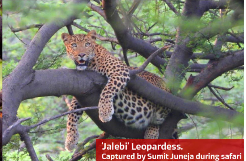
'Jalebi' Leopardess.